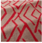
T0789002 DEEP RED