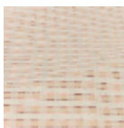
T0800003 Deep red