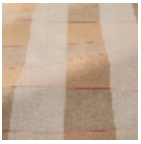
T0804001 New tomato