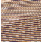
T0808001 Deep red