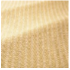
T0820001 Old gold