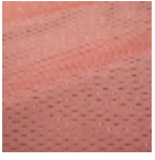
T0822001 New tomato