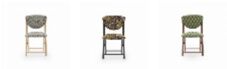
FDADACH FDADACH045 FDADACH045 FDADACH045 FDADACH045 FDADACH045 FDADACH045 AS DO T00 T10 T11