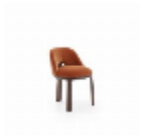
FDUNECH050 FDUNECH050 B2