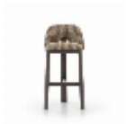
FDUNETB FDUNETB052 FDUNETB052 FDUNETBSPE B2