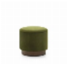
FMARTPO047 FMARTPO047 B