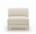
FPATTCF FPATTCF085 FPATTCF085B 2