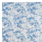
BP343001 Bleu de chine