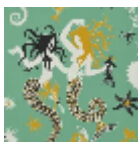
FP771003 MENTHE A L'EAU