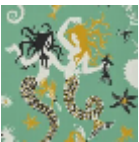
FP771003 MENTHE A L'EAU