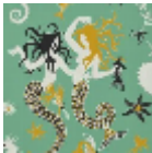
FP771003 MENTHE A L'EAU