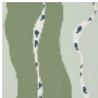
FP773003 Argile vert