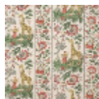
FP954004 Brique vert