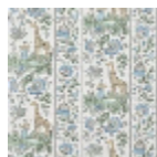
FP954001 Bleu aqua