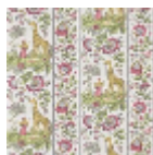
FP954002 Fuchsia anis