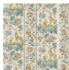
FP954003 Miel celadon