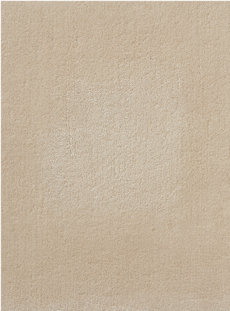
FT217001 - Naturel

Soft and shiny plain cut pile, made in our blended quality of New Zealand wool and our purest silk. One of our finest yarns.