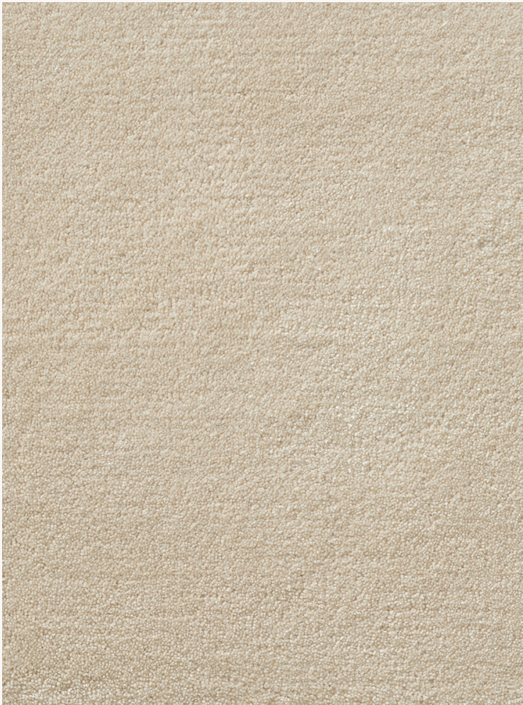
FT347001 - Naturel

Plain with a slightly speckled and satin look, made of New Zealand wool velvet blended with a shiny nylon yarn.