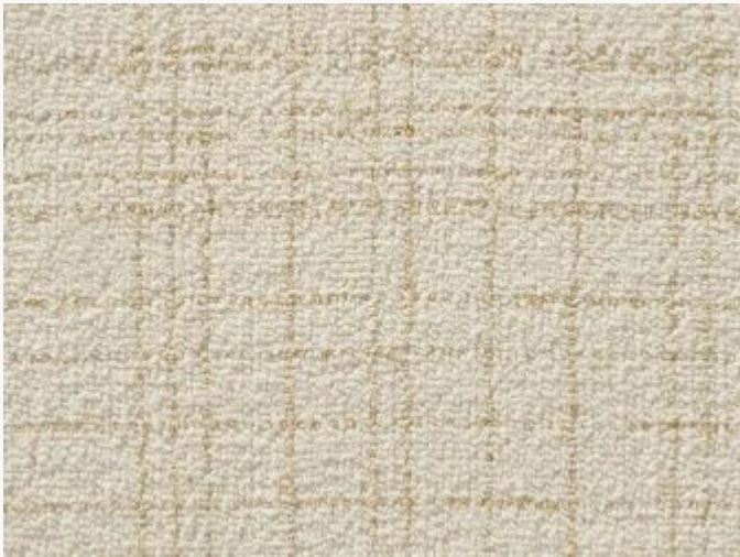
FT348001 - Naturel

Fine looped velvet texture drawing fine checks in a tartan spirit, made of New Zealand wool blend with a shiny nylon thread.