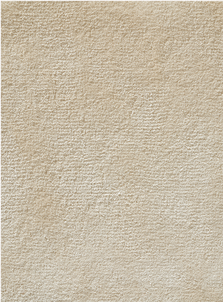
FT373001 - Naturel

A fluffy plain with a subtle sheen, in velvet cut from our finest silk yarn called "Delicate Silk" for a more natural look.