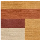
FT421002 Ocre rose