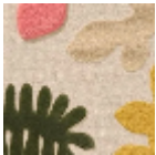
FT430-HT_000 2 FT430001 Multicolore